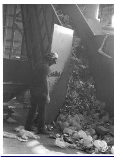
At Rumpke's Material Recovery Facility in Dayton, commingled recyclables from Darke County go up the conveyor belt to be sorted