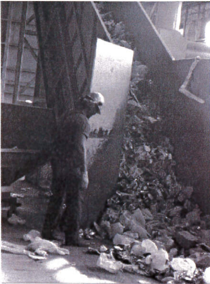
At Rumpke's Material Recovery Facility in Dayton, commingled recyclables from Darke County go up the conveyor belt to be sorted